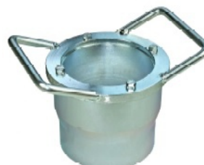
Pot for slips